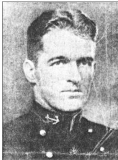
Frank Glasgow Tinker (July 14, 1909 – June 13, 1939)