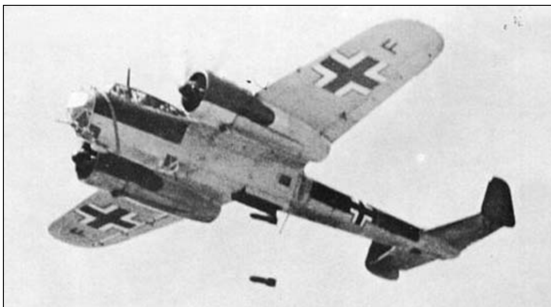
Dornier Do 17 Z-2