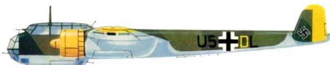
Dornier Do 17 Z-2 3./KG 2