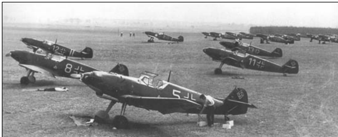
"Doras" and "Cezars" of Gentzen JGr 102 on Gross-Stein airfield in August 1939. Messerschmitts just under preparing for invasion against Poland...