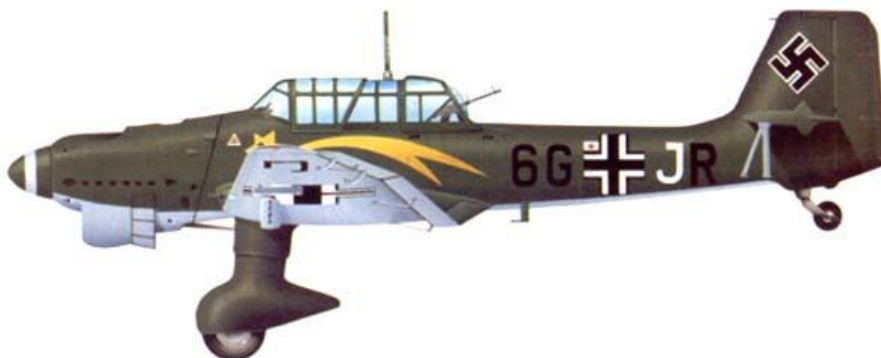
Junkers Ju 87 Stuka