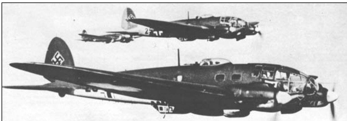
Heinkel He 111P-1